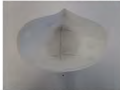
Inside View ***End of Report***